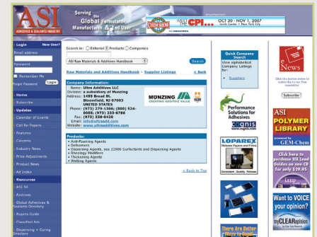
Company information appears online on company spec page.