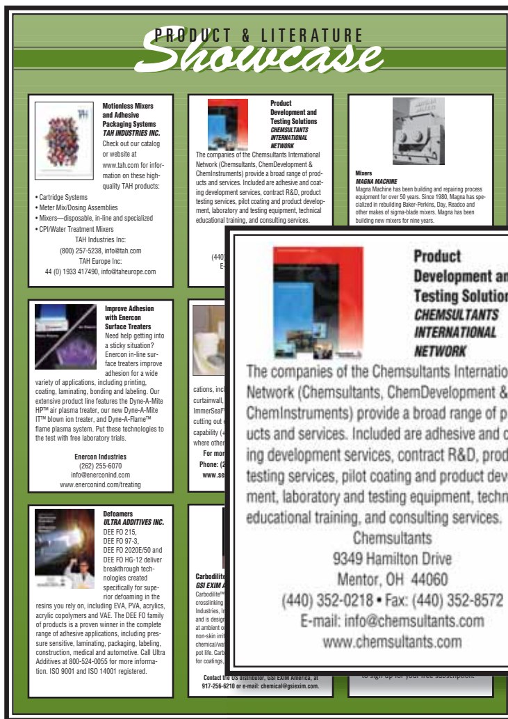
showcase shown actual size

January July April October June November