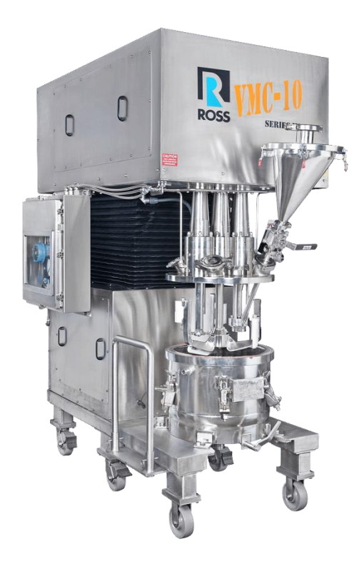
ROSS Sanitary VMC-10 VersaMix