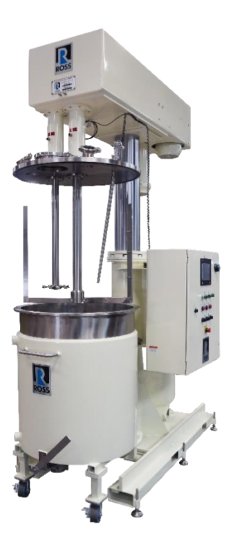
ROSS CDA-25 Dual Shaft Mixer

In combination, stationary high shear devices and an anchor will process formulations that are several hundred thousand centipoise.