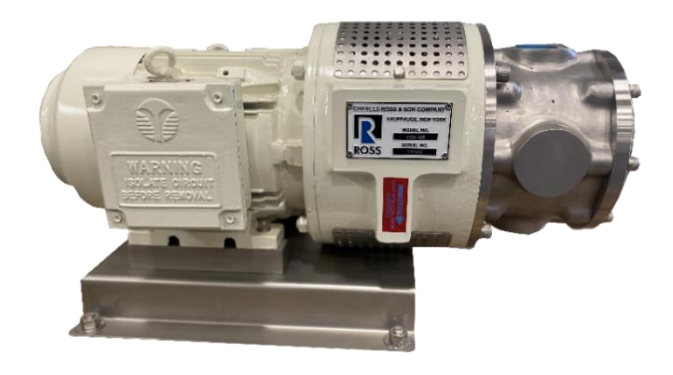
ROSS HSM-100 Series Batch High Shear Mixer with Mobile Lift